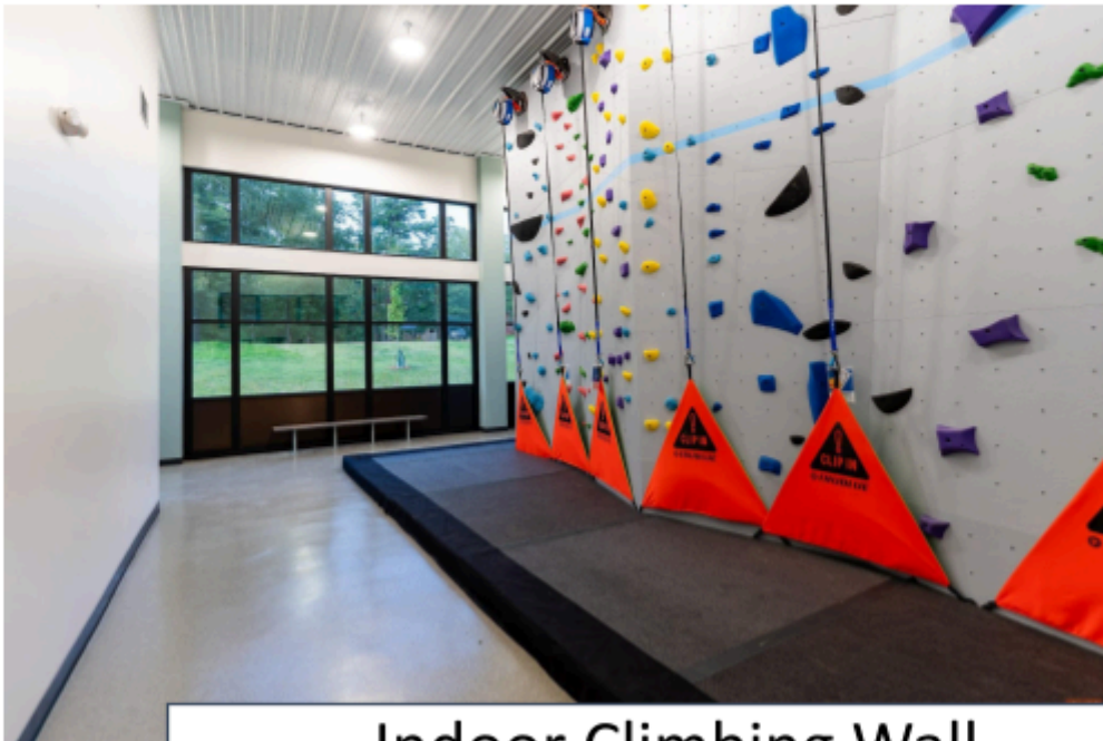
Indoor Climbing Wall