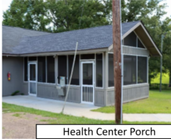
Health Center Porch