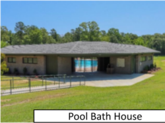
Pool Bath House