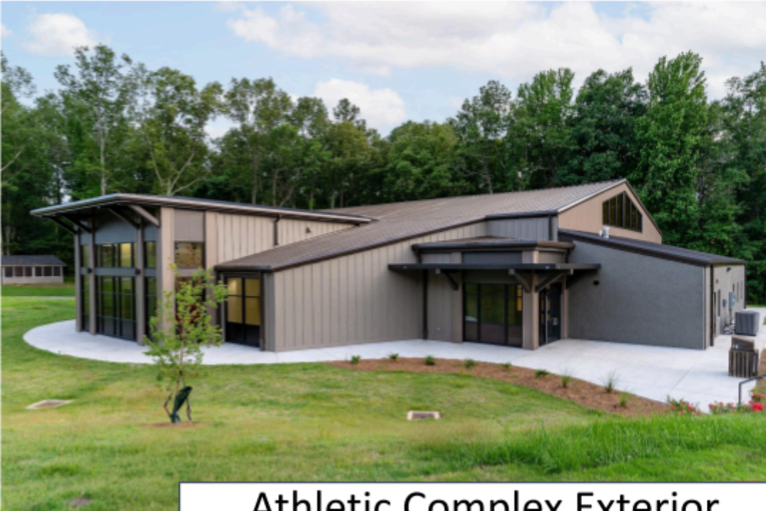
Athletic Complex Exterior