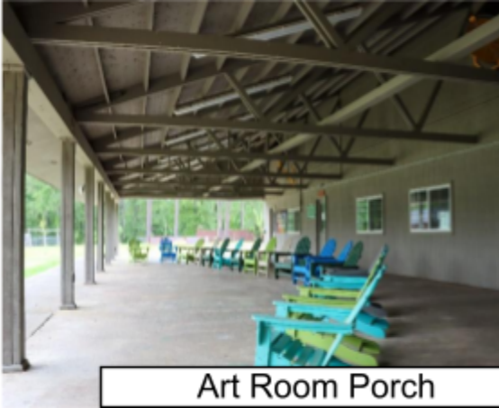
Art Room Porch