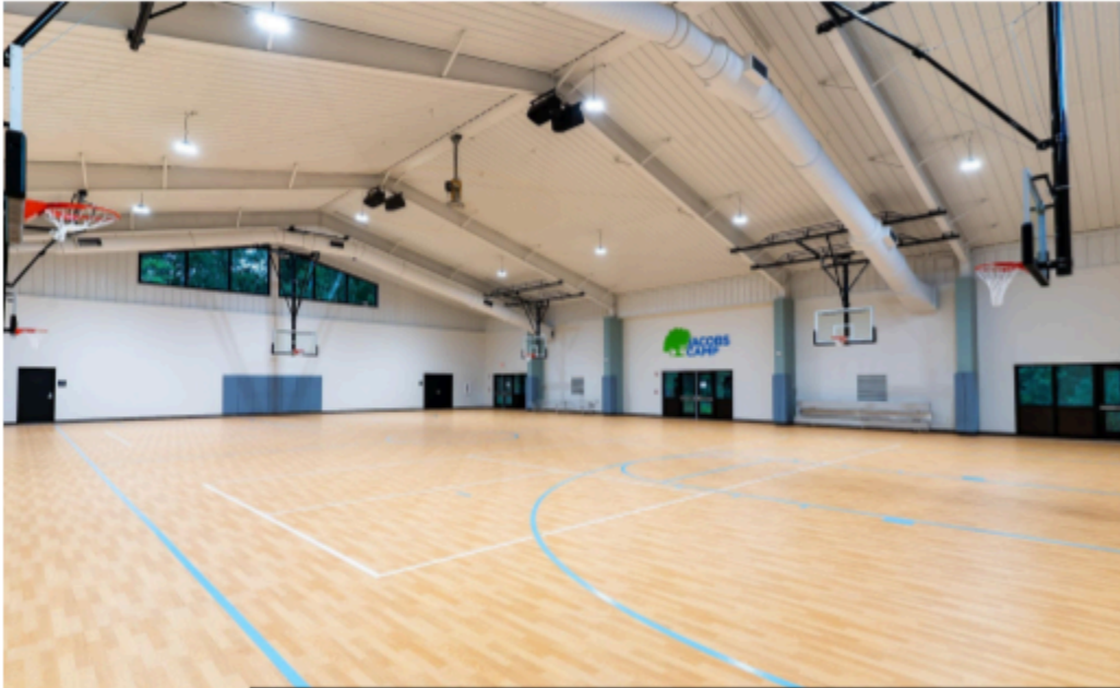
Athletic Complex Interior